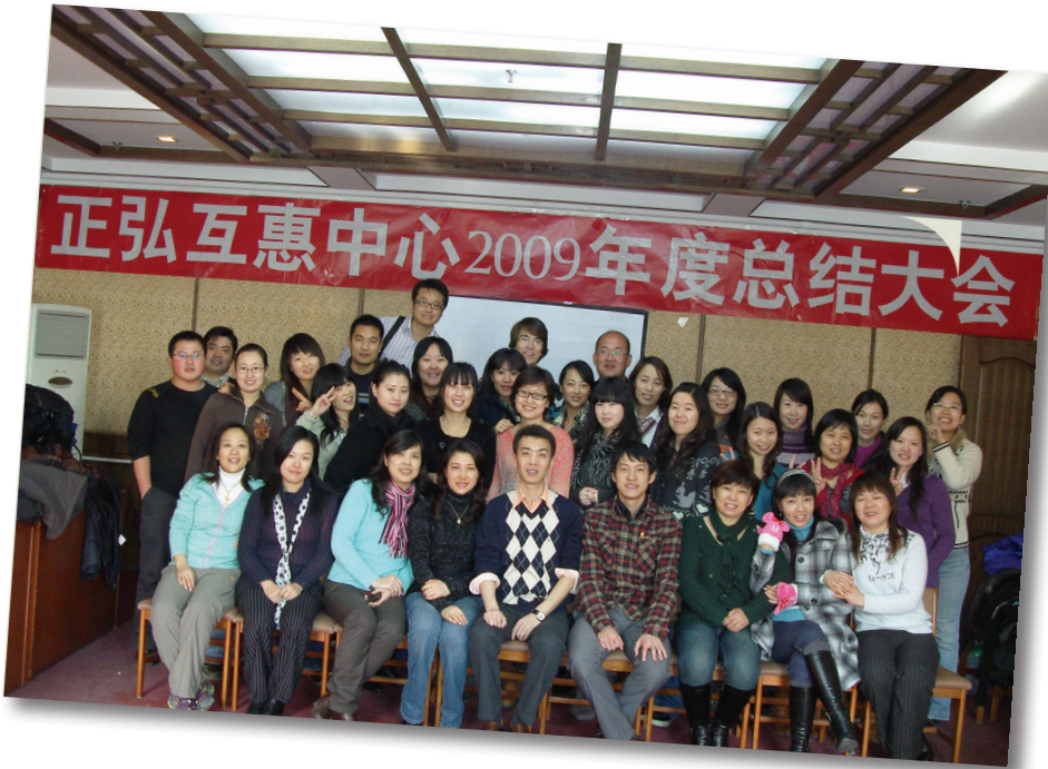
PHOTO : HHS Staff Beijing, Annual general assembly 2009

Founded in 2001 and based in Beijing, ZhengHong-HHS International Cultural Exchange Center keeps ahead by being the first and largest au pair agency in China. As a member of the International Au Pair Association (IAPA) and the World Youth Student & Educational(WYSE)Travel Confederation, we are dedicated to promoting international cultural exchange by offering versatile and flexible programs to young people from China and overseas.